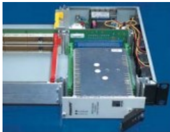
Power interface and rear I/O close-up examples